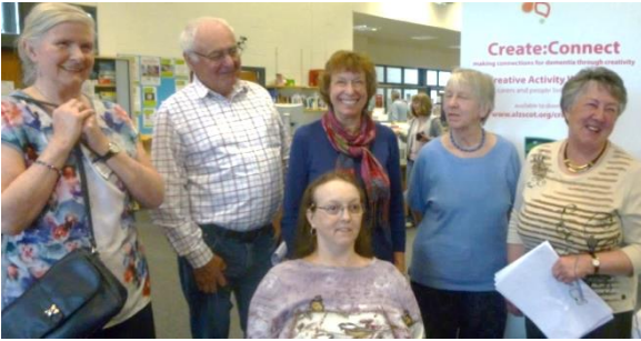
Members, volunteers and carers lead the singing at Create Connect Event May 2015