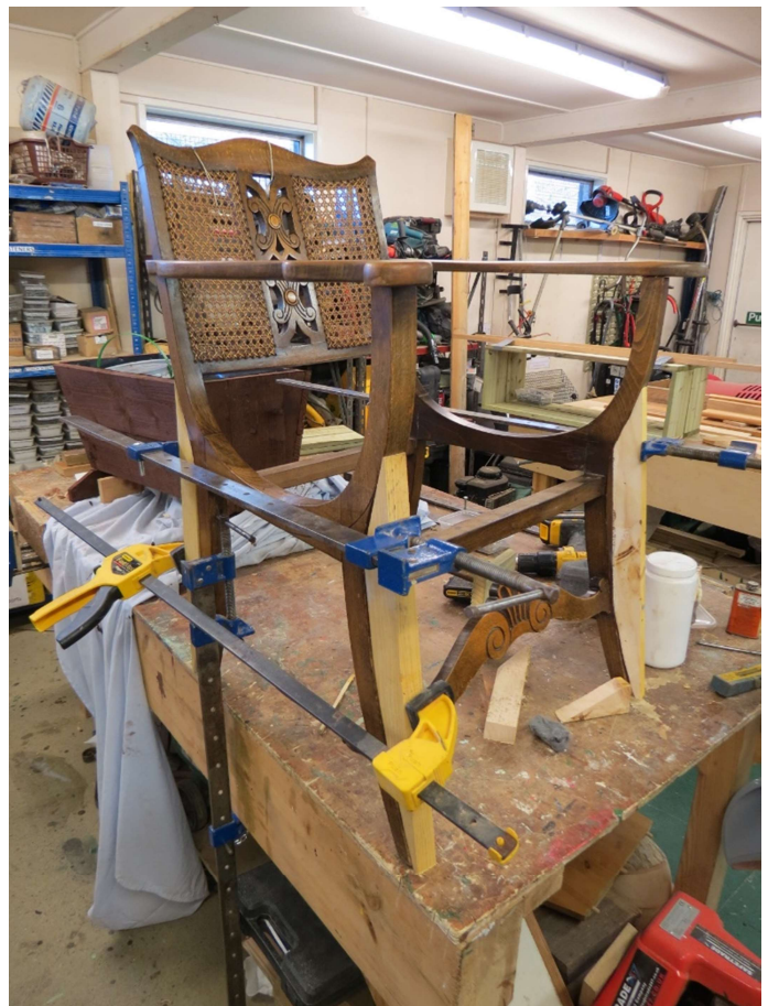
A patient in splints

1 was bought in and taken away before we could look at it, we don't know why.