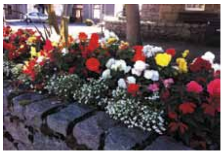
Summer display outside the Town House.

Many of the other actions in this plan are high level and Gariochwide, and are intended to improve the quality of life and have an impact across the whole area. It is pleasing to see that the actions in the Kintore Community Action Plan are entirely complementary to those in the local community plan.