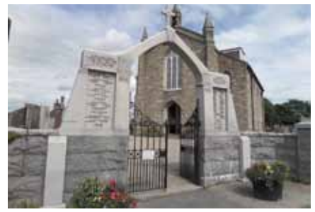
Kintore Parish Church and War Memorial.