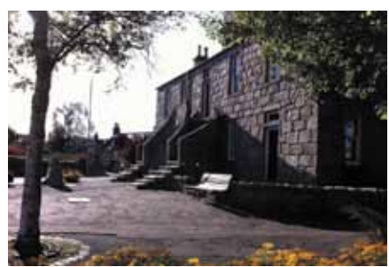
The Town House.

Kintore was a busy village which catered for everyone's needs. It had three grocer's shops, three small sweet shops, a working bakery, an egg grading station, four petrol stations, three garages, a shoe maker and shop, joiner and undertaker, butcher, chemist, and post office. "Dibs" was a shop that did leather repairs, watch repairs, gent's hairdresser, bookies, it didn't matter what you asked for they could help you out.