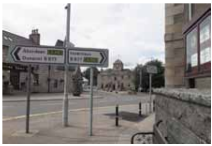
The heart of Kintore.