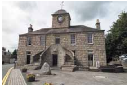
Outside the Town House.