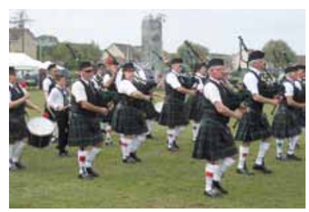
Kintore Pipe Band at the Summer Festival