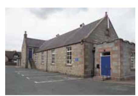
Kintore Village Hall.