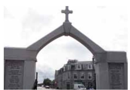
Looking out from the Church.