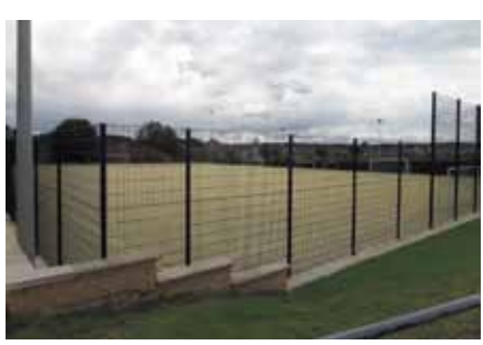
All weather pitch.