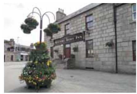
The pub and the Square.

A summarised Action Plan for each of these headings follows: