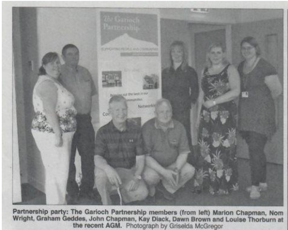
TGP Board and staff at the Summer Forum 2018