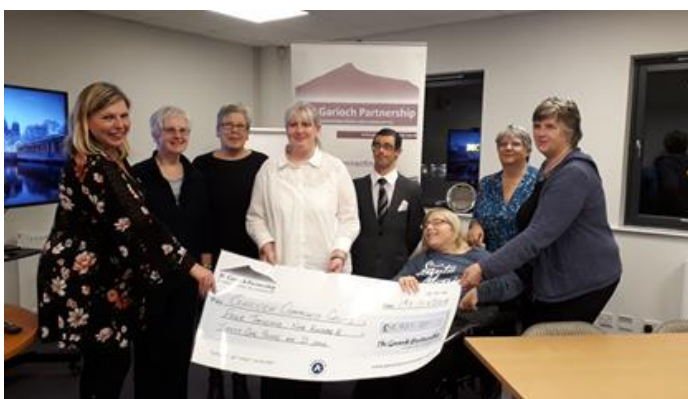
Photo shows some of our recent grant recipients at our Winter Forum hosted at The Fly Cup, November 2018

A total of £5840.06 has been invested locally from the community initiatives grant fund, and a further £1000 from the Garioch resilience fund.