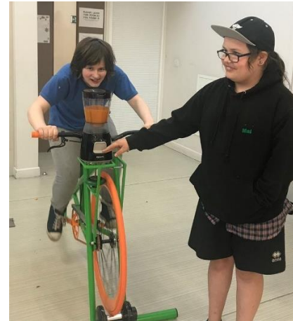
KBASC presentation and the “Smoothie Bike” for the youth resilience project in action! (picture from Live Life Aberdeenshire Facebook post) Below: Picture from UryRiverside Park newsletter

TGP continues to use a participatory budgeting approach through its “grants panel” of local